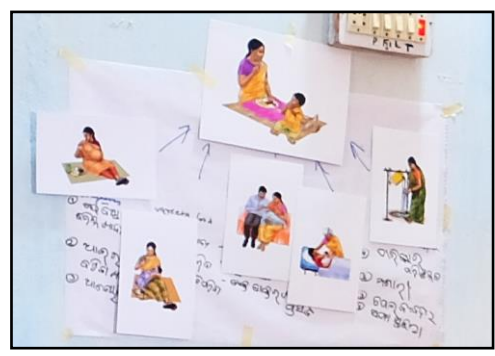
Mother care map from training in India

are taped to the page, draw arrows from the pictures to the healthy, well-nourished women (see the example photo as well as images below).